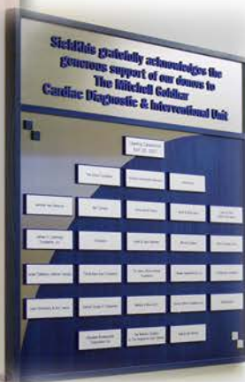
Satellite Donor Wall