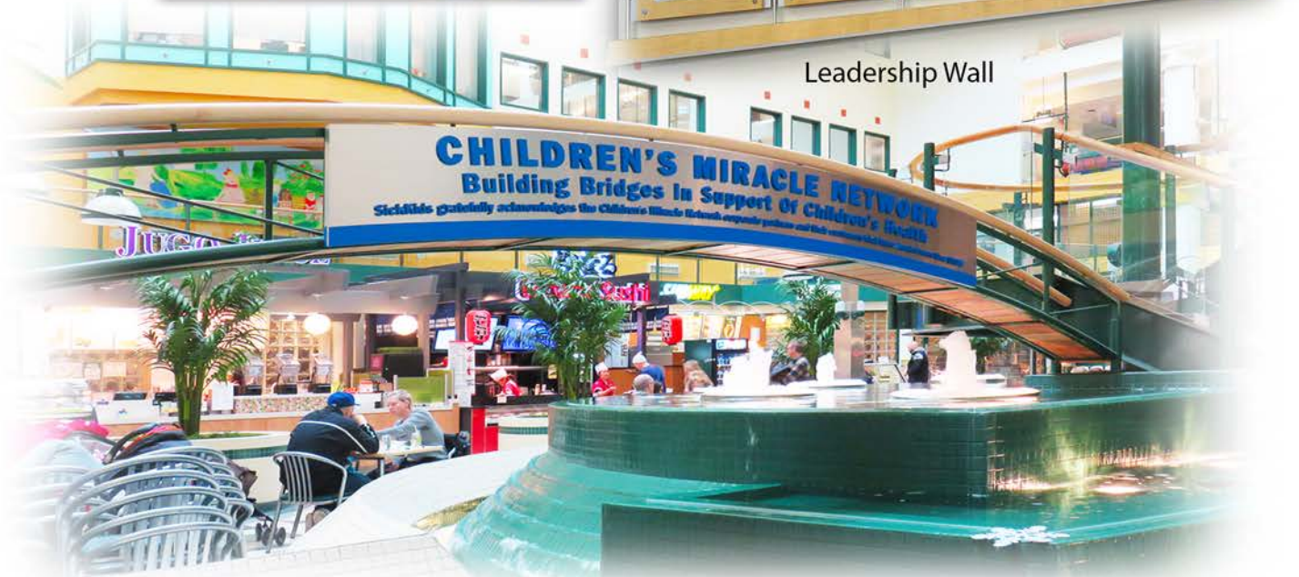
Children's Miracle Network Recognition Bridge