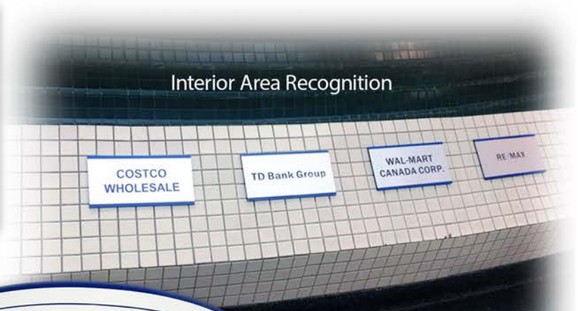
Interior Area Recognition