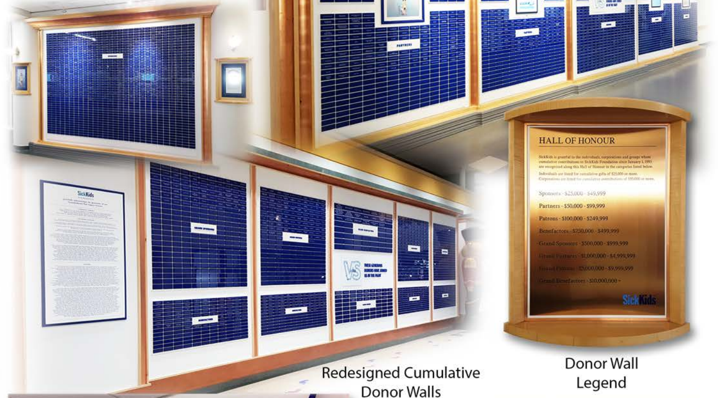
Redesigned Cumulative Donor Walls