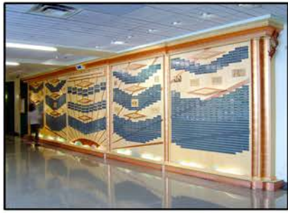
Original Cumulative Donor Wall