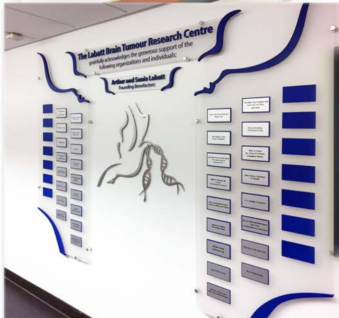
Cumulative Donor Wall